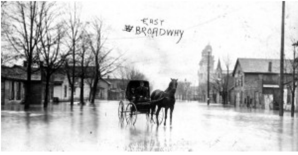
Archive File: 2013-03-13_1913-flood-lecture.pdf ©2022 - Strand Theatre Shelbyville, Inc.